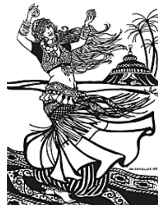
#144 Tribal Style Belly Dancer

The newest pattern from Folkwear is #144 Tribal Style Belly Dancer. It is in stock and ready for immediate shipment. This exciting sewing pattern features instructions for sewing six garment pieces. ❖