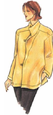
San Diego Jacket