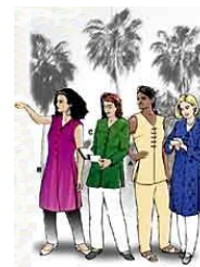
Kusamba Tunic & Pant