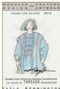
Panel Top & Panel Vest